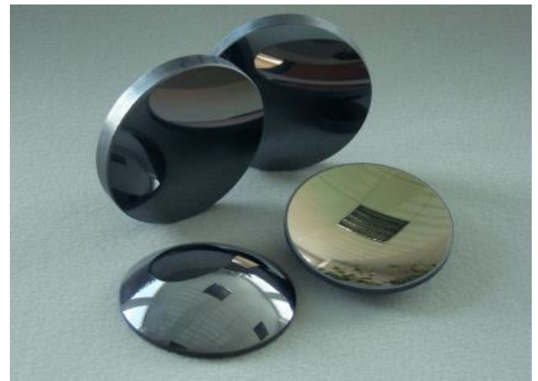
Typical delivery in form of blanks:

VITRON currently produces 5 different types of Chalcogenide Glass that are applicable to optics and optoelectronics system design.